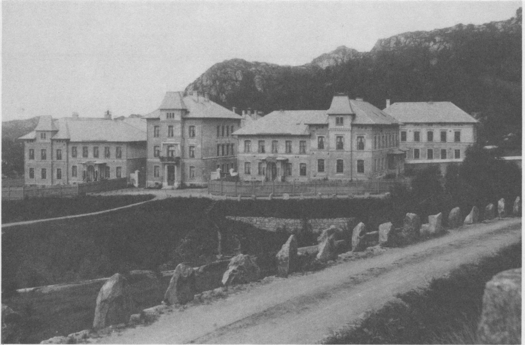
«Bergens Byes Sindssygeasyl, Neevengården». Anno 1893.

Norwegian official statistics: The activities of the mental asylums 1941